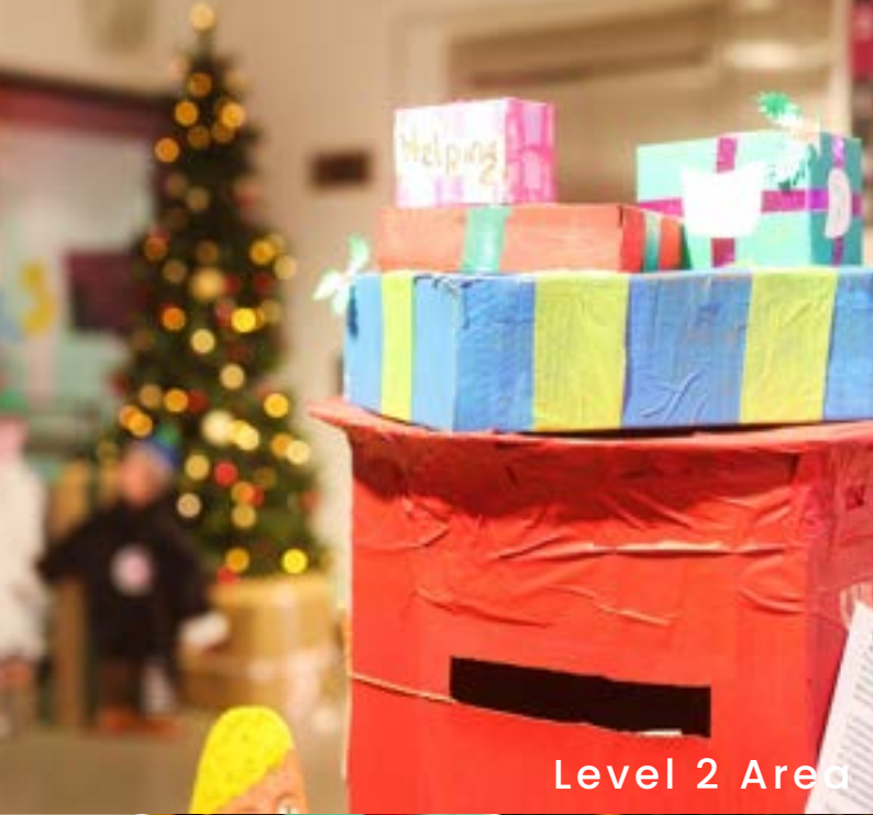
Level 2 Area