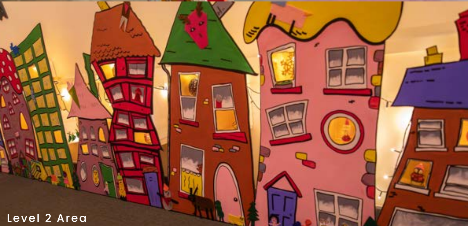
Level 2 Area