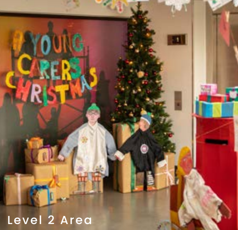
Level 2 Area