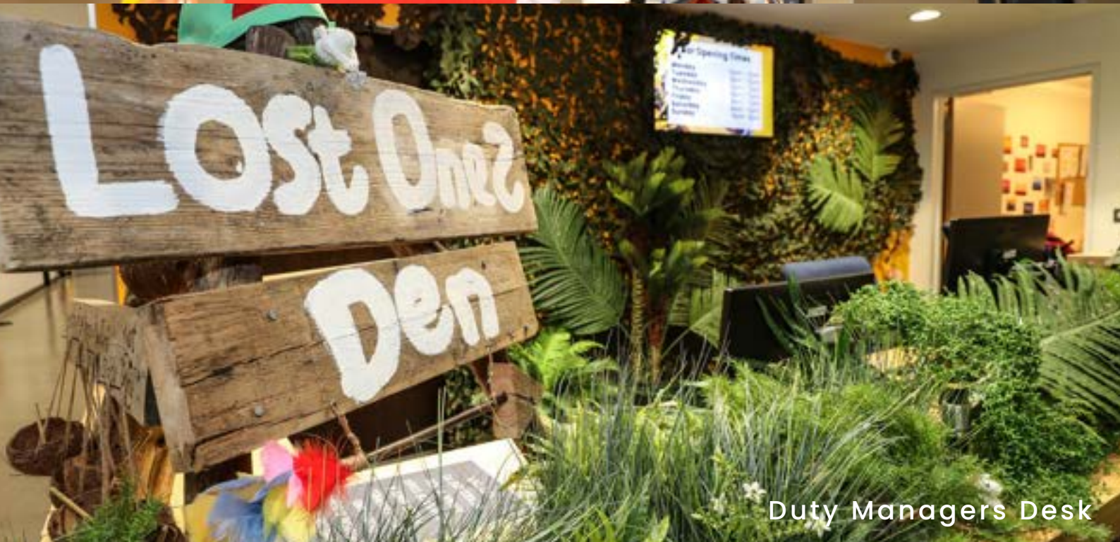
Duty Managers Desk