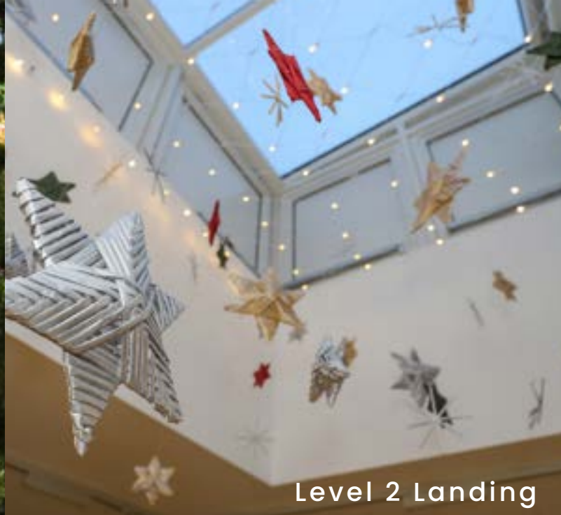
Level 2 Landing