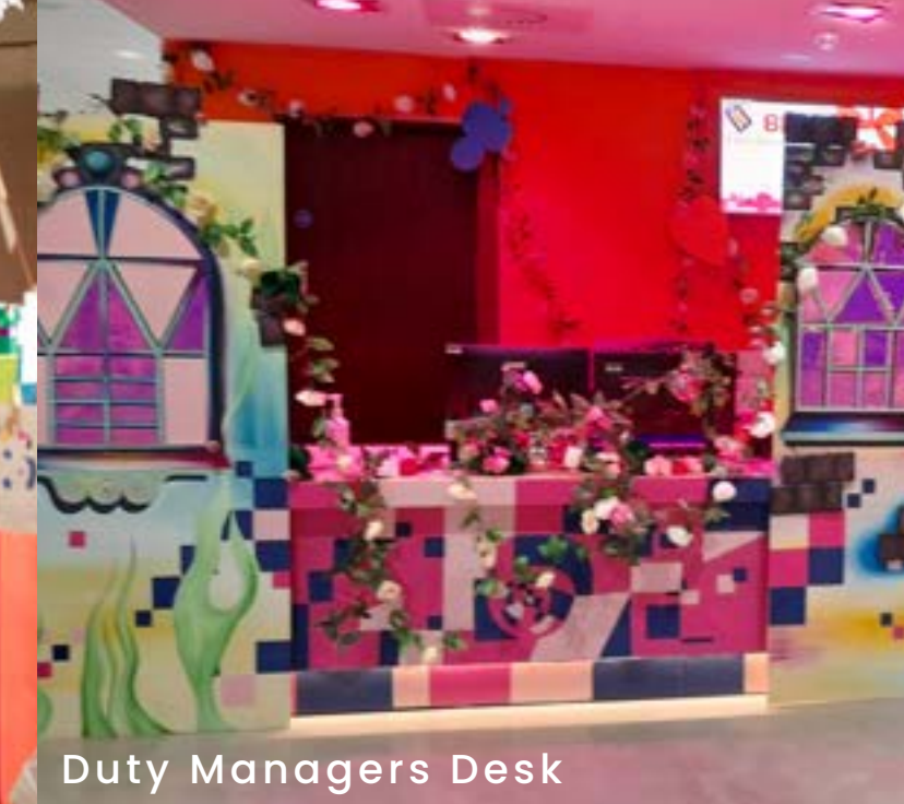
Duty Managers Desk