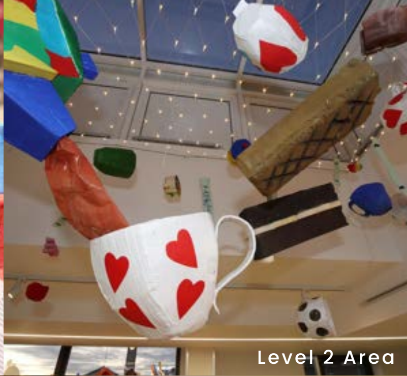
Level 2 Area